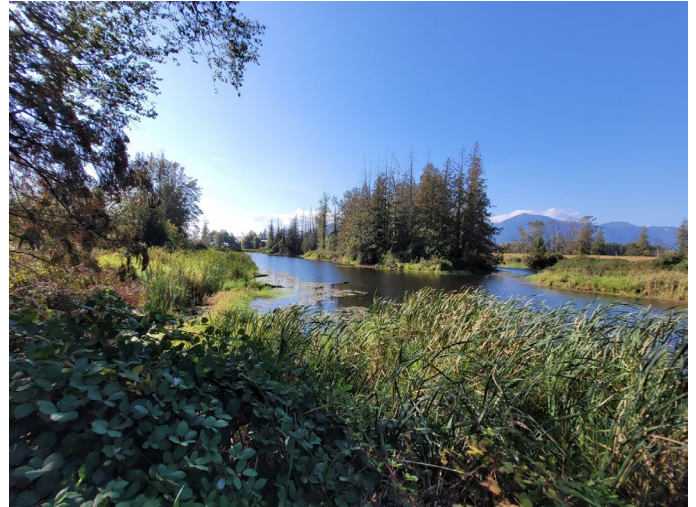
Bell Slough.

Any time you alter land within 30 meters of a watercourse, a Development Permit and Riparian Area Protection Regulation Assessment is likely required – even if the watercourse is not on your property. For more information about Development Permit Area 3, please call the Land Development Department at 604-793-2902 or visit chilliwack.com/DPAs .