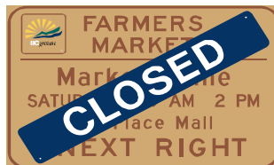
180 X 20