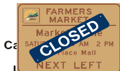
100 X 20