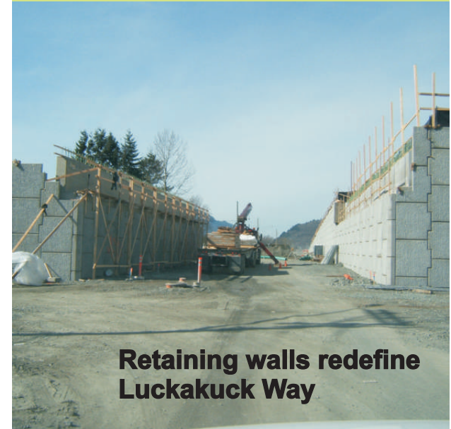
Retaining walls redefine Luckakuck Way