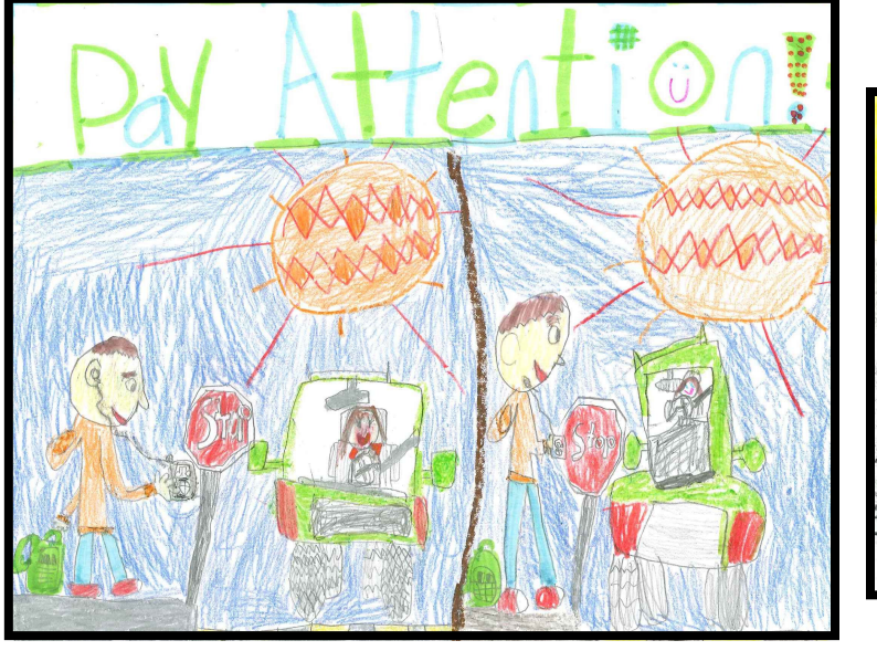
Artwork courtesy of: Emma, Grade 2

of children on or near the road, could represent an