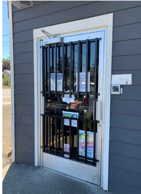
Retractable Grill with Hidden Box (L) and Fixed Gate with Plain Detailing (R):