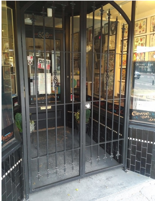
Fixed Gate with Ornate Details (L) and Plain Bars Installed over Door (R):