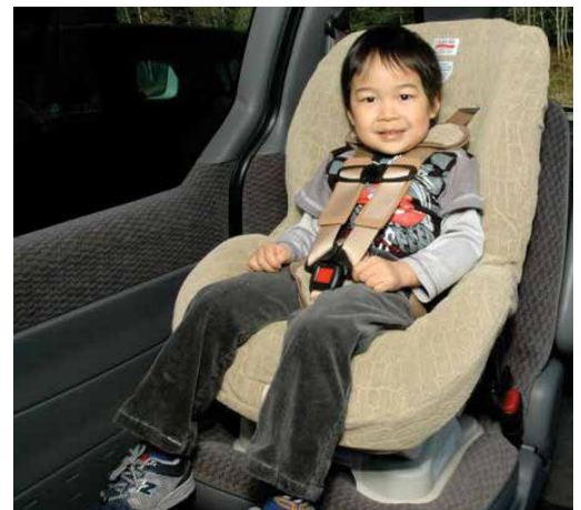
Child seat installed forward-facing