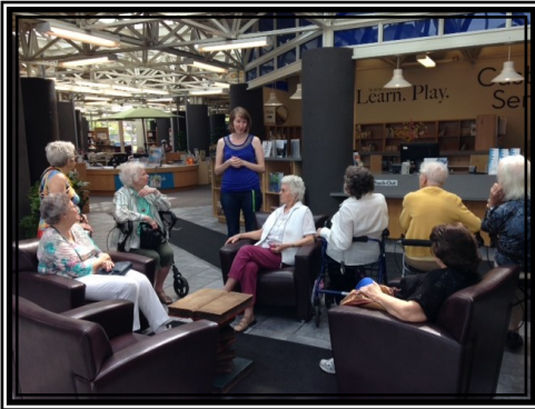
Residents of Chartwell House orientation

In May, Sardis Library celebrated the one year anniversary of opening its door to customers. Sardis library officially recognized the milestone in June by hosting a First Birthday Celebration. Sardis Library Staff and customers had a lot to celebrate! During the first year of operations, Sardis Library Staff registered nearly 3,000 new customers and had nearly 6,500 adults, teens and children in attendance at library programs. Circulation statistics at Sardis library continue to exceed expectations, and staff are continuing to develop and host new programs attracting customers of all ages.