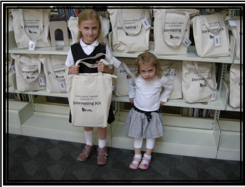
Chilliwack's Storytelling Kits