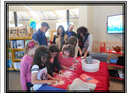
Sardis Aboriginal Artist in Residence