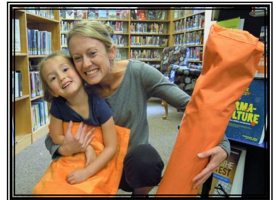
Winners of Yarrow Days